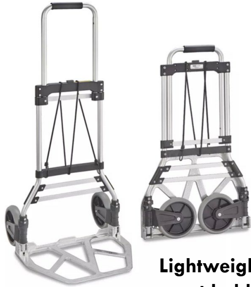
Lightweight luggage cart holding up to 75 lbs max